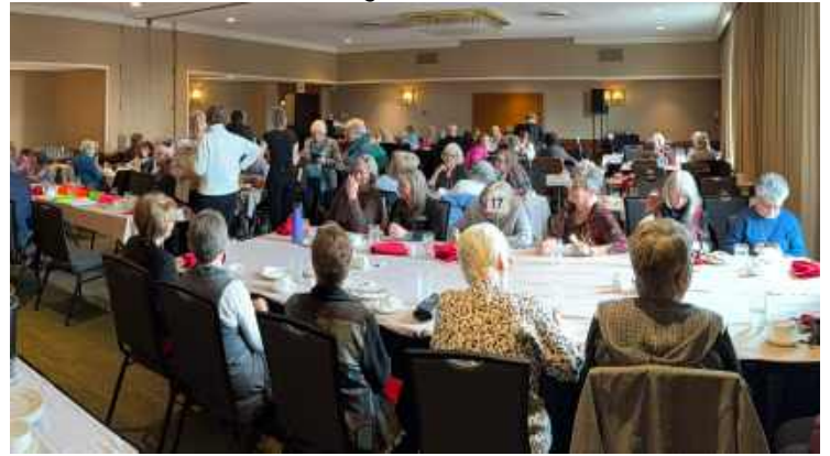
Members Luncheon Buffet