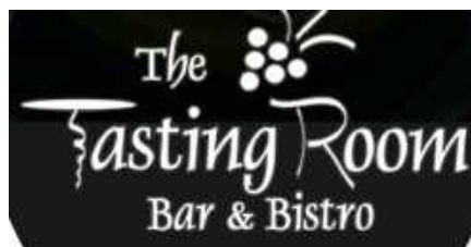
$50 Gift Certificate