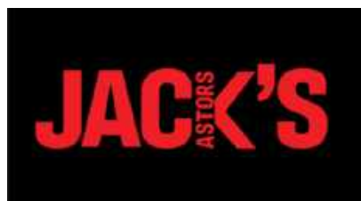
$50 Gift Certificate