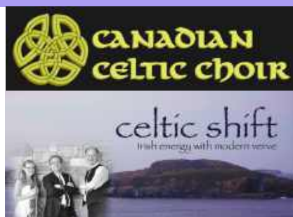
Two tickets to May 30th Concert