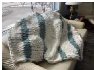
White and grey plush knitted quilt 60" X 50"