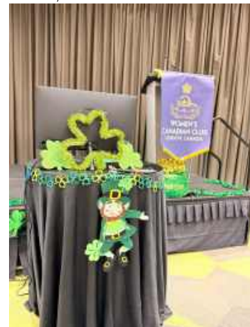
St. Patrick's Day Decorations