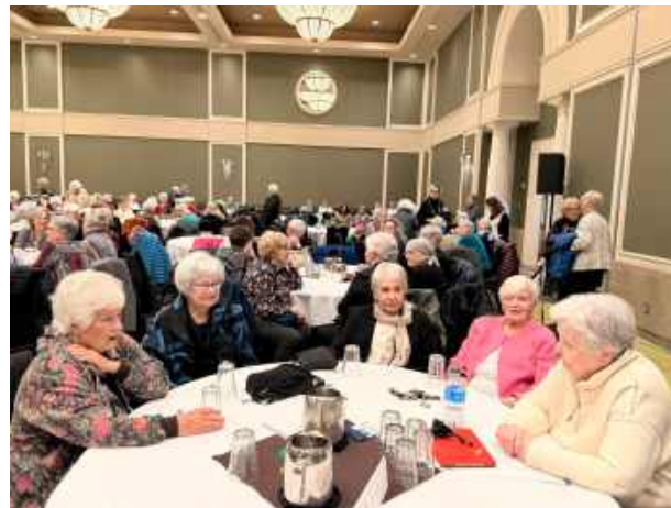
A full ballroom of WCCL members and their guests for the March Speaker Event