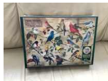
Cobble Hill Backyard Wildbirds of North America Puzzle