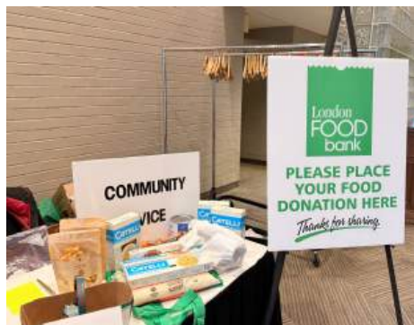
Community Services Collection