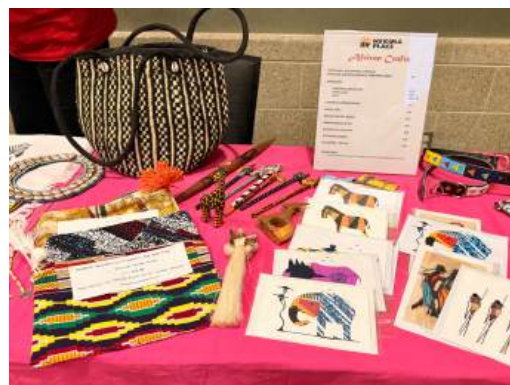
African Craft Table