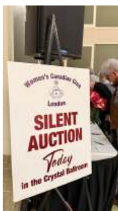
Silent Auction Poster